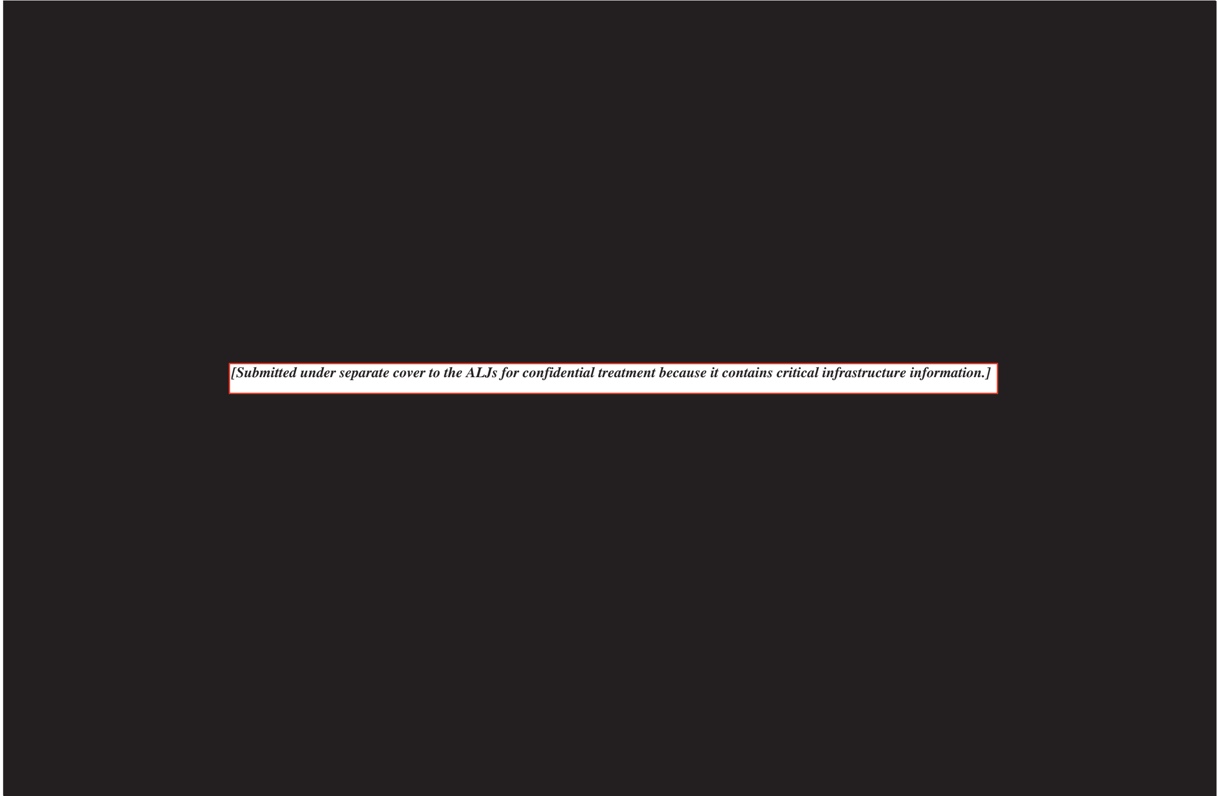
Figure E-4-2: Interconnection Area for the Project

[Submitted under separate cover to the ALJs for confidential treatment because it contains critical infrastructure information.]